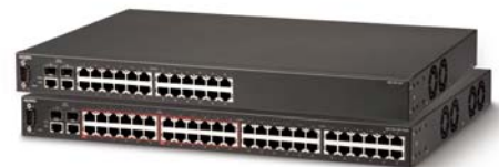
Nortel Business Ethernet Switch 100